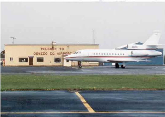
Oswego County Airport terminal building