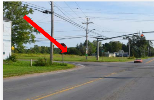
Approach from southbound CR6