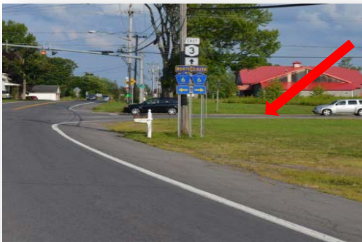
Approach from eastbound SR3