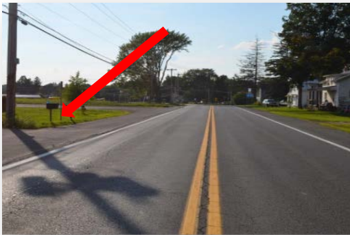
Approach from westbound SR3