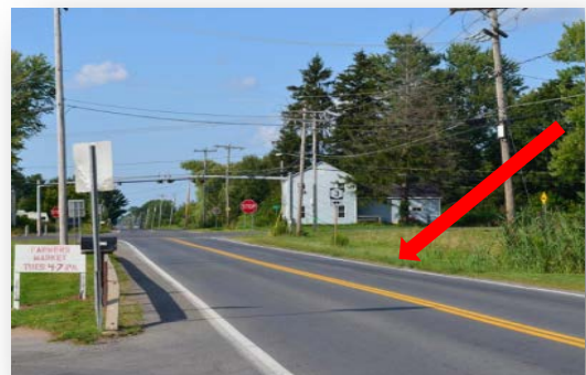
Approach from northbound CR6

Build-to-Suit SE Corner NY State Hwy 3 & CR 6, Volney, NY 13069