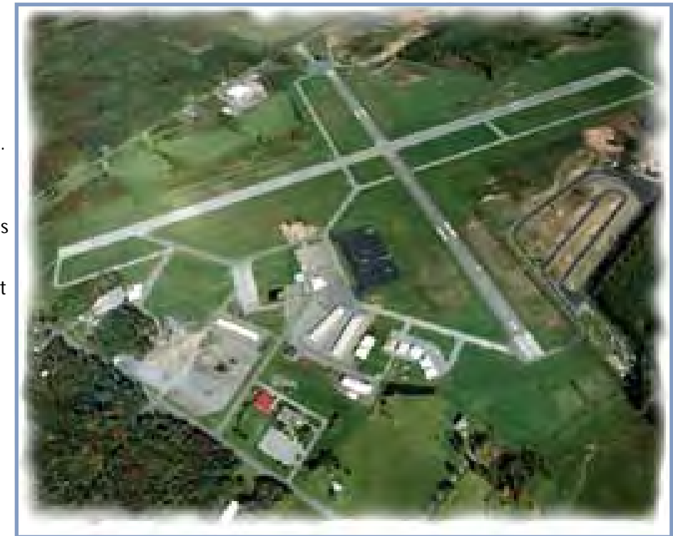
The Howard Road site is located just north of the Oswego County Airport.

It provides a state-of-the-art Instrument Landing System (ILS), Auto Pilot Control Lighting, hangar stalls and tie-downs, charter service, terminal building, 100 low-lead and Jet A fuel, and flight school offering a joint aeronautical college degree program with Cayuga Community College and Dowling College.