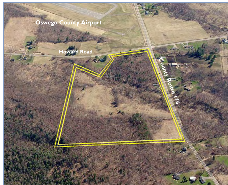
View of the Howard Rd. parcel looking south towards the County Airport.

Preliminary geotechnical information from borings taken on site is available from OOC. Additional technical details on site conditions and other environmental features are also available.